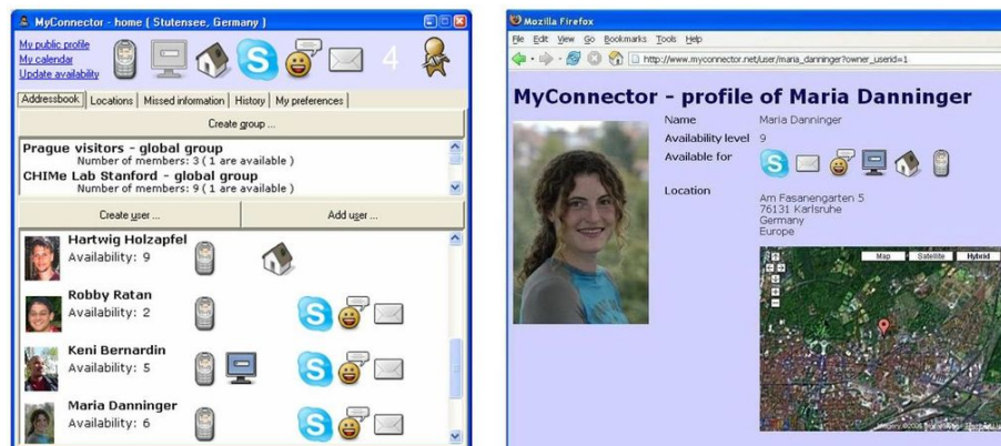
Fig. 3. Screenshot of the MyConnector Windows XP client and web interface showing a user's public profile.

MyConnector is the Connector client running on Windows XP (screenshot shown in Figure 3). It provides an interface to set preferences and manage contacts. Along with phone communication, MyConnector lets the user send emails, send instant messages, and allows conference calls (via the Skype API). In the contact list, various symbols are displayed showing the availability of the contact person for communication media such as Skype IM, Skype call, email, office phone, home phone and cell phone. MyConnector does as well gather PC activity in the background as context cue to learn user availability.