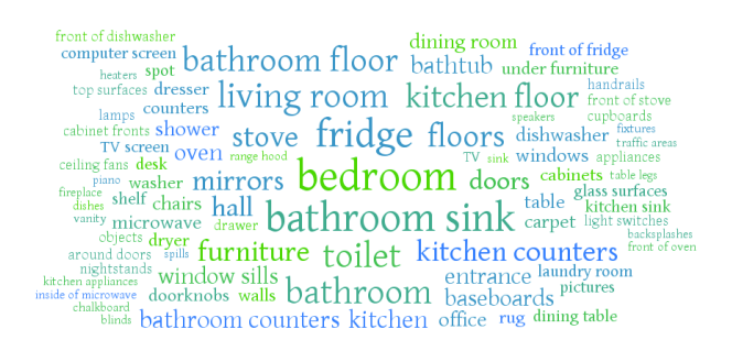
Figure 3: Word cloud of targets for cleaning actions such as wipe, vacuum, dust, sweep or mop.

One of our motivations in creating a comprehensive task list for domestic robots, is to identify task components that require end-user programming. Although a lot of the functionality for doing house chores can be built in, end-users will