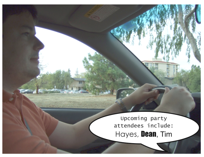
Figure 1. Example use case scenario for the audio priming system

Information gathering for upcoming events is not a new idea [2], but many interface design questions remain open. The audio priming system differs from prior work in (1) its use of an audio interface optimized for the demands of mobile, inter-event contexts and (2) its inclusion of information and modes of presentation designed for more than explicit information transfer.