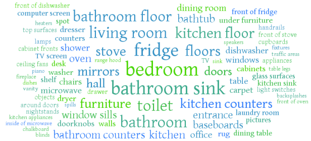
Figure 3: Word cloud of targets for cleaning actions such as wipe, vacuum, dust, sweep or mop.

need to program their robots at different levels. The operation of a robot will drastically differ from home to home, based on the users' preferences and the features of the home.