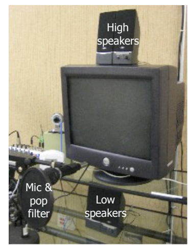
Figure 1. Experiment setting: Participants' ears were brought to the mid-point between speakers; the monitor was left off until it was time to fill out the questionnaire

The participants' voices were amplified and projected from either low or high spatial locations, using the microphone, mixer, and speakers. They practiced speaking into the microphones and listened for their own voice projections before commencing with the study.